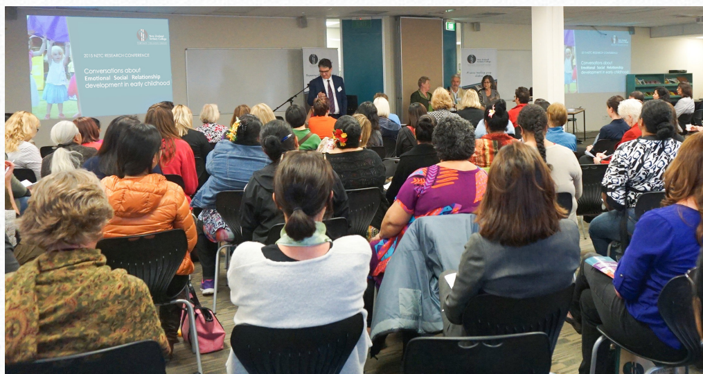
Delegates gain insights from an interactive panel discussion